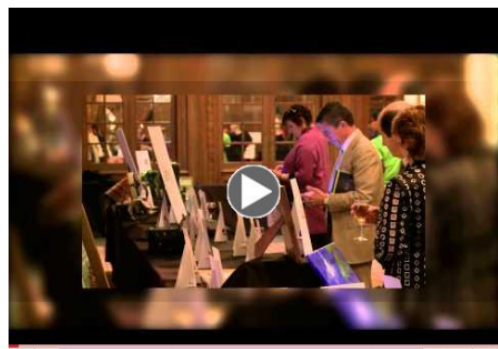
Child Advocates 2014 Annual Benefit Reception & Auction Highlight Video